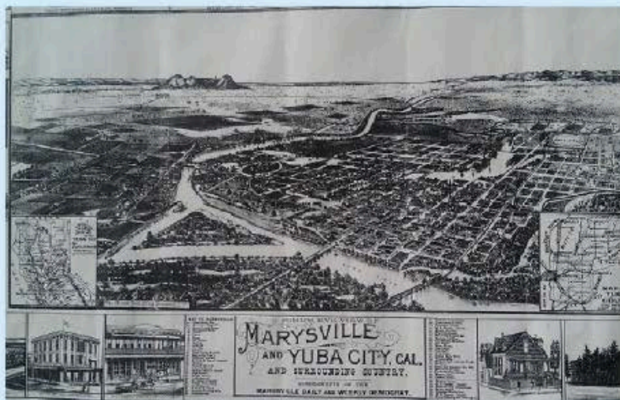
From Marysville Democrat newspaper 1900's

Together we honor what these landowners' parents and grandparents lived for and what they died for!